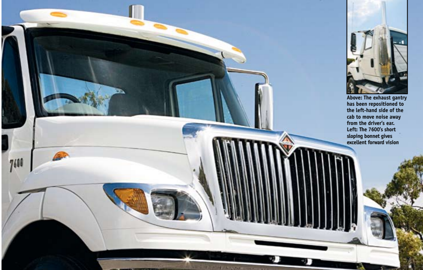
Above: The exhaust gantry has been repositioned to the left-hand side of the cab to move noise away from the driver's ear. Left: The 7600's short sloping bonnet gives excellent forward vision