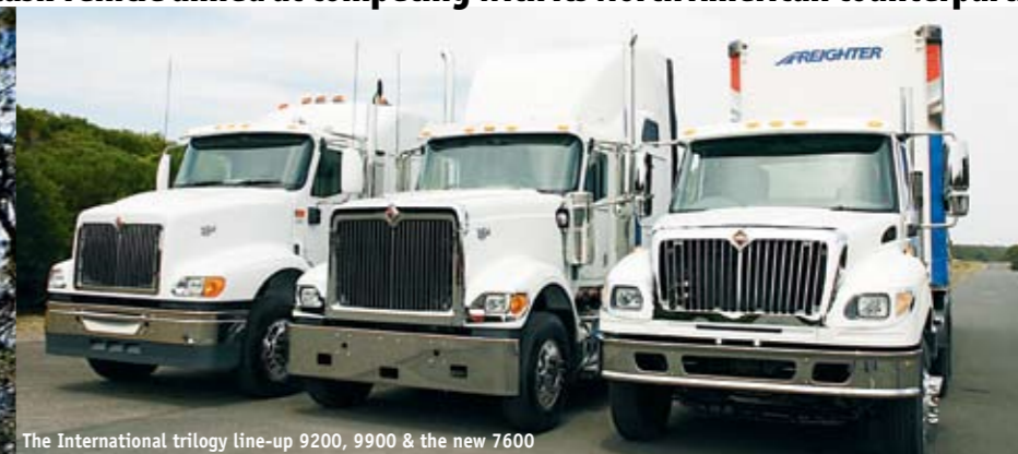
The International trilogy line-up 9200, 9900 & the new 7600

The new-bonneted 7600 will take on Mack, Kenworth and DaimlerChrysler's Sterling for a slice of the lucrative light end of the heavy-duty prime mover single trailer (to 48ft with sleeper cab) and rigid tipper and dog market. In 2006, 1023 trucks between 336hp and 440hp were sold.